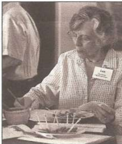
Tasting attendees were very careful as they evaluated the taste, texture, aroma, and appearance of the meat samples.

This event was the largest comparison of beef breeds in North America to date and it successfully demonstrated that each of these breeds is valuable for the unique culinary experience it offers.