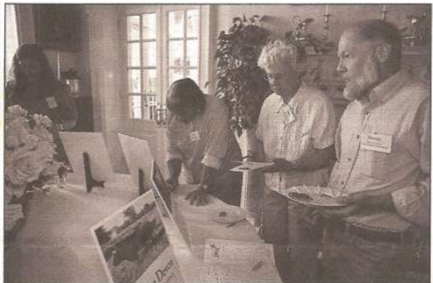
Many attendees were surprised that they could tell differences between breeds during this blind tasting. The winner of the popular vote was revealed to be the Randall Lineback.