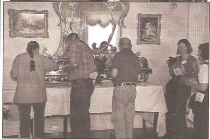
Meat from the chuck section of a steer of each breed was roasted simply, without spices, cut into bite-sized pieces, and presented in covered dishes at numbered stations. Numbered toothpicks and scorecards were provided.